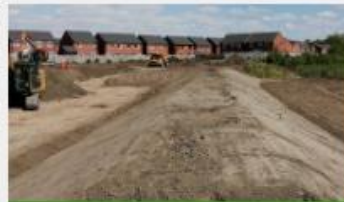
Radcliffe and Redvales (Greater Manchester)