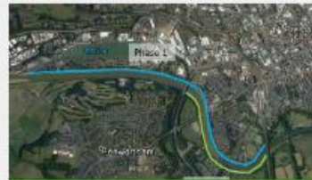
Preston and South Ribble (Lancashire)