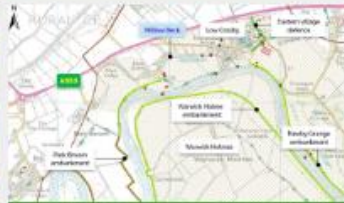
Low Crosby (Cumbria)