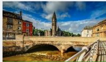
Rochdale and Littleborough (Greater Manchester)